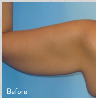
Slimmer arms without the scars

BodyTite: is a great solution for individuals who are looking to reduce fat without the saggy, wrinkly skin. BodyTite is a minimally invasive procedure that shapes, tightens and lifts without the scalpel or scar. You are left with surgical-like results without the added downtime.