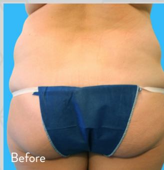
Significant reshaping of the lower back